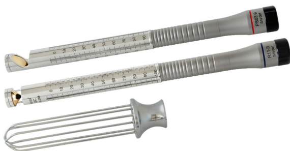
Figure 1 G-Set accessories needed for application of the erbium:YAG laser beam to the vaginal mucosa, consisting of a laser speculum plus angular and circular adapters

Various evaluation tools were used to measure the efficacy of erbium therapy for SUI. Several investigators used the International Consultation on Incontinence Questionnaire-Urinary Incontinence (ICIQ-UI) questionnaires and all found significant reductions in the ICIQ-UI score. Fistonic and colleagues reported a reduction of more than 6 points at 6 months after a single treatment 11 , Lukanovic reported an improvement of 3.7 points after 3 months and a single session 12 , while Gambacciani and Levancini reported more than 6 points of improvement after 3 months and three sessions of erbium therapy 13 . Sencar and Bizjak-Ogrinc used ICIQ-UI to define the incontinence severity index (ISI) according to Klovning; after the treatment, the ISI decreased by 2.6 \pm 1.0